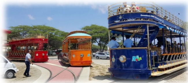
Self-powered new build tradition summer tram cars

Heidi Alexander, Transport Secretary, backs Very Light Rail (VLR) https://www.bbc.co.uk/news/articles/cm28lzmj79no