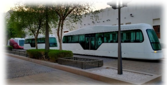
City Cars (3), autonomously coupled, 300 passengers