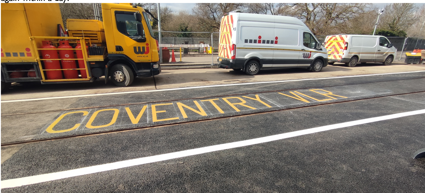
A section of the lightweight test track - CVLR

"If there is a problem with the services, so if there's let's say a gas leak, you can turn off the gas and very quickly access the track. Remove a section, fix the leak, refit the track and get the system running again within a day."