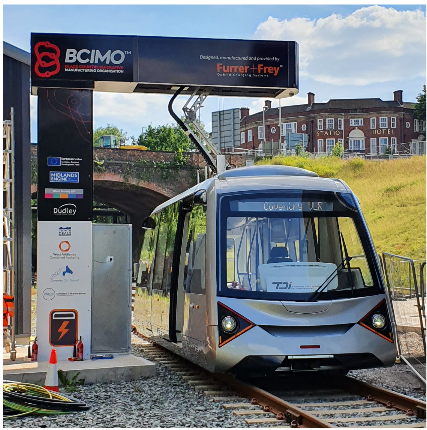
A test vehicle at the VLRNIC - BCIMO

Although the centre's remit extends well beyond CVLR, the Coventry project is a substantial part of its current workload and helped make the case for establishing the VLRNIC in the first place. Success with Coventry could act as a catalyst for wider adoption of very light rail, helping to spur a whole new transport ecosystem around it. This could help put the Centre at the forefront of technological development across several fundamental areas, including signalling and even autonomy, as well as the core functions of track and vehicle development.